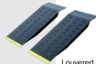
Louvered approach ramps

Challenger's 14,000 lb. closed-front drive-on 4-post lift features a low approach angle and wide runways for easy approach. It also has one of the highest rise in the industry and durable column construction. We designed the 4P14 for versatility, with louvered approach ramps as well as in two lengths. A range of optional accessories can help you accommodate just about anything that comes in for service.